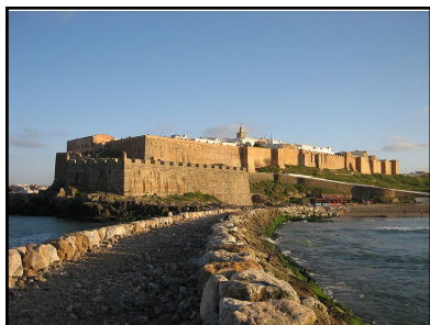
Oudaia Kasbah, the citadel of Rabat, Rabat.